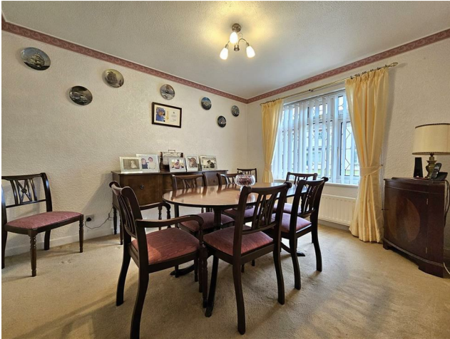
A pleasant room with a window to the front elevation. With ceiling light and wall mounted radiator.